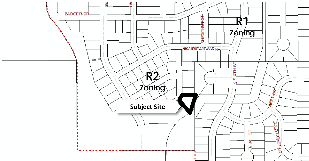
Figure 1 Location Map

Direct questions and comments to: Jason.sergeant@ci.evansville.wi.gov or 608-882-2285